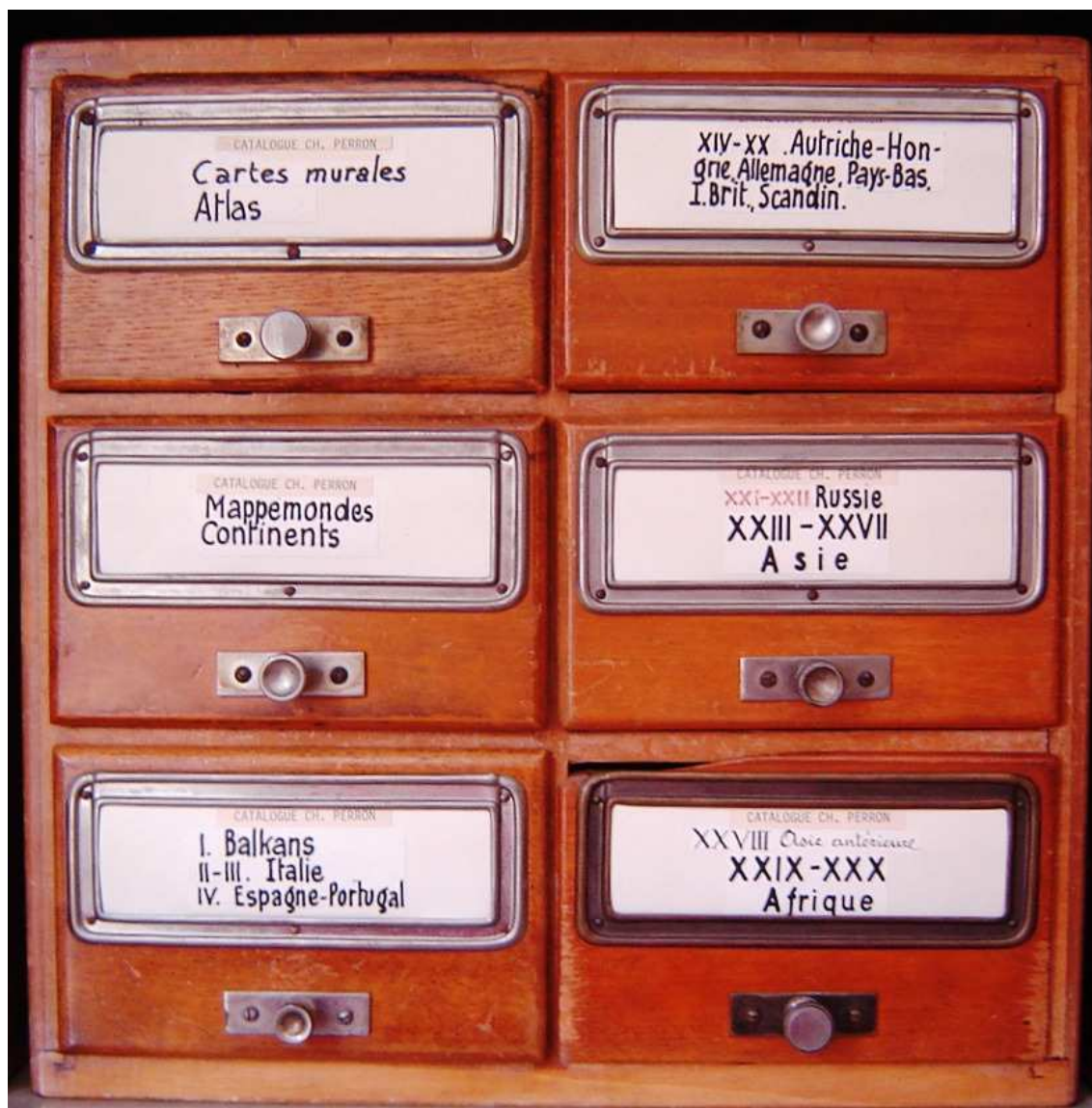
Fig. 5 The first part of the Perron's catalogue, BGE, Département des Cartes et Plans

Only during a second period, after receiving donations from Genevan citizens and members of the Geneva Geographical Society, did the collection begin to include a relevant amount of 'rare', 'ancient' and 'original' pieces according to collectors' standard of the time. Secondly, the main aim of the project was the utilization of maps for a social and public goal: namely, making them truly available to anyone.