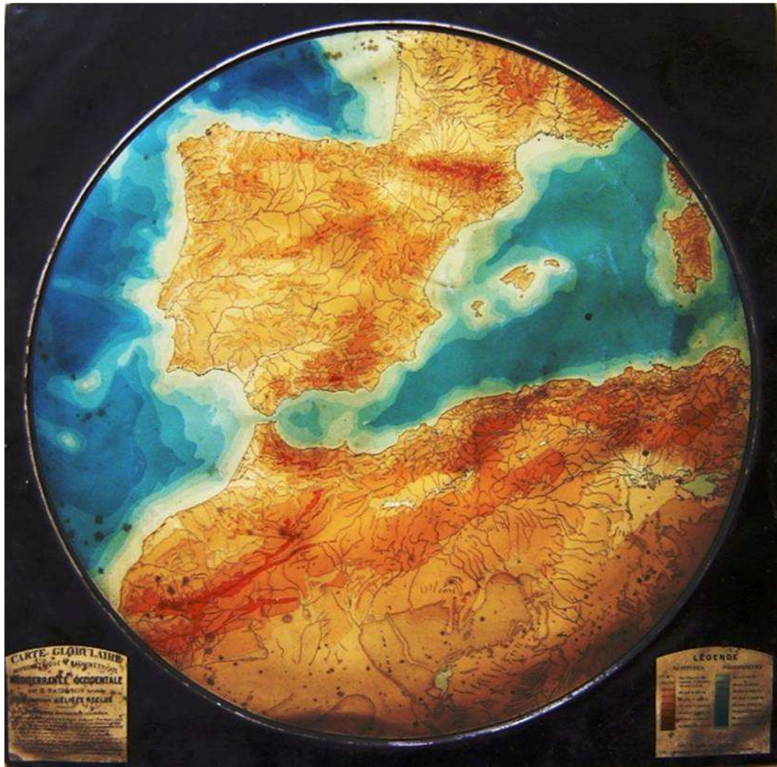
Fig. 4 The Spherical Map of the Western Mediterranean, BGE, Département des Cartes et Plans

Geographical Society, when the most famous Anglophone geographers of that time, such as Mackinder, Herbertson and Ravenstein, took part in the discussion. 45 This Atlas aimed to represent the whole world on 46 curved sheets of aluminum at the uniform scale of 1:5.000,000, without altitude in relief but with the ‘exact’ terrestrial curvature.