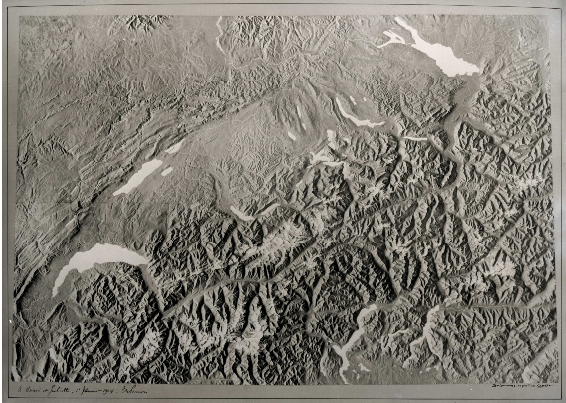
Fig. 2 A photograph of the Perron relief, taken by Fred Boissonnas and autographed by the author – Geneva, Centre d'Iconographie Genevoise, Fonds Boissonnas

mountains and alpinism (fig. 3), Perron's relief is a rare case of a national image of Switzerland which does not include its boundaries (fig. 2); rather, it follows the tradition of 'Natural Region Geography,' independent of political power. 44