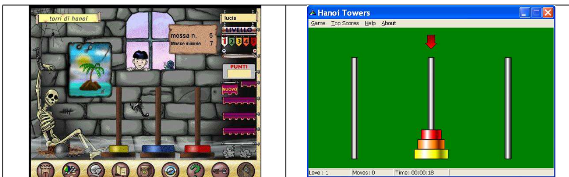
Fig. 1 Different interfaces for the same game (Hanoi Towers)