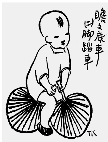
Fig. 4. “Education n°2” (in Zikai huaji , 1927)

of an ideal social order characterized by peace and happiness. The creativity of children, their inventions or unexpected ideas as well as their wild imagination are especially praised by Feng Zikai, as an evidence of their great potential. This shows that this fashionable and positive vision of childhood has rubbed off on him. For example, a cartoon called “The Bike of Zhanzhan” (“Zhanzhan diche (2), Jiaotache” 瞻瞻底車 (二) 腳踏車, 1927) stages Zhanzhan riding an imaginary bicycle made with two fans of banana leaves of which he holds the handles (Fig. 4).