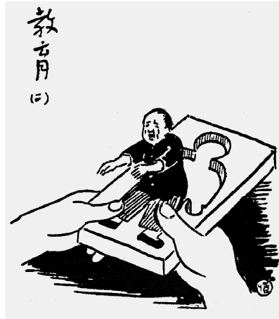
Fig. 3. “Education n°2” (in Ertong manhua , 1932)

Michael Nylan argues that in traditional China, children did not only spend long hours in intensive learning in the goal of becoming “truly human” ( cheng ren 成人), at least not during the two first stages of childhood (in the womb and until the age of seven). There was a space for play and fantasy, which were even encouraged for little children, in order to let them build a sturdy mind and body. It was during the third phase, until the age of 15, that the child was instructed to an awareness of self and society and prepared in mental, moral, and physical terms to adult life. 21 This was especially against this Confucian education and ritualised subordination that Chinese intellectuals of the new Republic rebelled. Two humoristic cartoon of Feng Zikai undoubtedly express this criticism: the first one, called “A Teacher” (“Mou zhong jiaoshi” 某種教師), shows a teacher during his class, but the head has been replaced by a gramophone, in order to denounce the repetitive side of his teaching. In another cartoon entitled “Education, n°2” (“Jiaoyu (2)” 教育(二), 1932), a child desperately tries to free himself from a mold where a huge hand wants to insert him by force (Fig. 3).