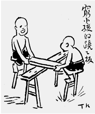
Fig. 5. “The Swing of Poor Children” (in Chexiang shehui , 1935)

It suggests that even in the worst deprivation, children remain inventive: through their boundless creativity, they embody hope. In a cartoon entitled “Sitting alone” (“Du zuo” 獨坐, 1945), a child immersed in a building game can be seen from the rear, capturing this extreme concentration specific to the playing child. Without the his ingenuity, could utopia or art exist? This is probably the meaning of the drawing of the cartoon entitled “The Origin of Architecture” (“Jianzhu de qiyuan” 建築的起源, 1927), where a child piles up the elements of construction blocks, an attempt of research and exploration in which Feng Zikai sees the premises of architecture and art (Fig. 6).