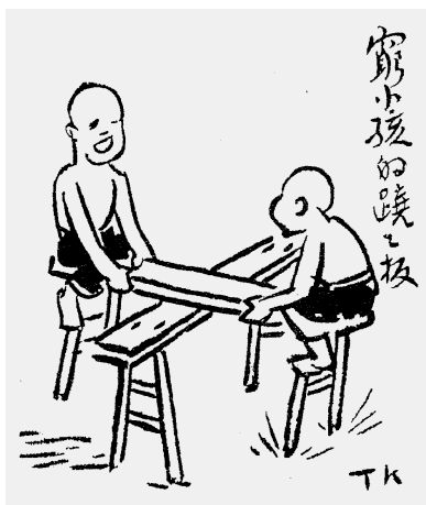
Fig. 5. "The Swing of Poor Children" (in Chexiang shehui , 1935)

It suggests that even in the worst deprivation, children remain inventive: through their boundless creativity, they embody hope. In a cartoon entitled "Sitting alone" ("Du zuo" 獨坐, 1945), a child immersed in a building game can be seen from the rear, capturing this extreme concentration specific to the playing child. Without the child's ingenuity, could utopia or art exist? This is probably the meaning of the drawing of the cartoon entitled "The Origin of Architecture" ("Jianzhu de qiyuan" 建築的起源, 1927), where a child piles up the elements of construction blocks, an attempt of research and exploration in which Feng Zikai sees the premises of architecture and art (Fig. 6).