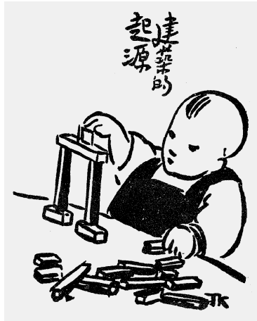
Fig. 6. “The Origin of Architecture” ( Zikai huaji , 1927)

It suggests that even in the worst deprivation, children remain inventive: through their boundless creativity, they embody hope. In a cartoon entitled “Sitting alone” (“Du zuo” 獨坐, 1945), a child immersed in a building game can be seen from the rear, capturing this extreme concentration specific to the playing child. Without the his ingenuity, could utopia or art exist? This is probably the meaning of the drawing of the cartoon entitled “The Origin of Architecture” (“Jianzhu de qiyuan” 建築的起源, 1927), where a child piles up the elements of construction blocks, an attempt of research and exploration in which Feng Zikai sees the premises of architecture and art (Fig. 6).