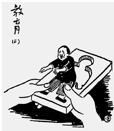
Fig. 3. “Education n°2” (in Ertong manhua , 1932)