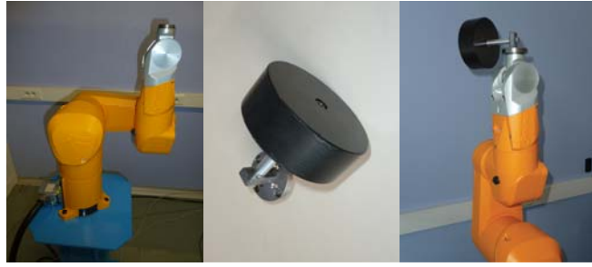
Fig. 1. TX-40 robot and its calibrated payload of 4.59 Kg.

The Stäubli TX-40 robot (Fig. 1) has a serial structure with six rotational joints. Details on its kinematics can be found in [13]. It is to be noted that the payload is numbered as the link 7, rigidly fixed on the last robot joint numbered as the link 6.