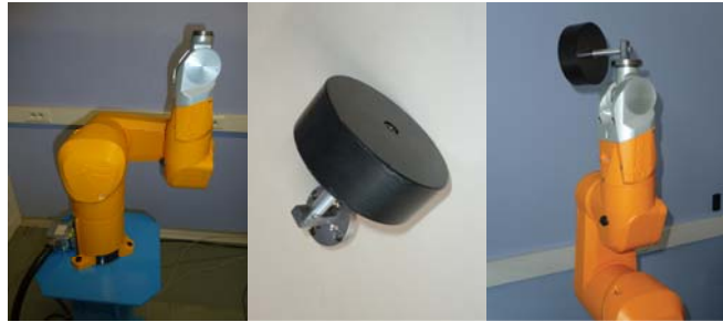
Fig. 1. TX-40 robot and its calibrated payload of 4.59 Kg.