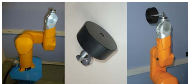
Fig. 1. TX-40 robot and its calibrated payload of 4.59 Kg.