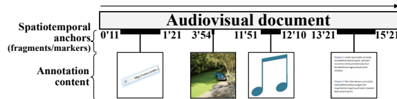
Figure 1: Video annotations anchors and content

PLICIT semantics: any active reading must thus be mediated through annotations that provide an explicit information layer along the document. Second, contrary to text reading, the reading speed is imposed by the player. The annotation process then requires some kind of interruption or interference from the viewing process, and this conflict between the temporality of the video and that of the annotation process must be addressed somehow.