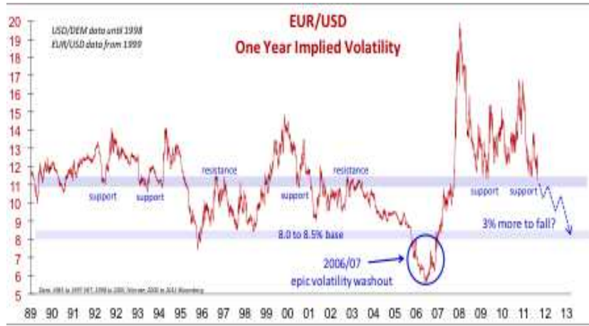
Fig. 2 Implied volatility of EUR/USD, source from marketpulse.com.

Stochastic volatility with jumps (SVJ) models have been very popular in the option pricing literature since they provide flexibilities to capture important features of returns distribution. However, empirical studies [7, 8] show that they do not well reflex large movements in volatility assets during periods of market stress such as those in 1987, 1997, 2008. In other words, SVJ are misspecified for such purposes. The studies also suggest that it would be more reasonable to add an extra component into the volatility dynamics so that this new factor allows volatility to rapidly increase. Note that such expected effect can not be generated by only using jumps in returns (as in jump-diffusion models) nor by using diffusive stochastic volatility. In fact, jumps in returns can only create large movements but they do not have future impact on returns volatility. On the other hand, diffusive stochastic volatility driven by a Brownian motion only generates small increase via sequences of small normal increments. Empirical analyses in important works [7, 8] show that incorporating jumps in stochastic volatility can provide rapid changes in volatility.