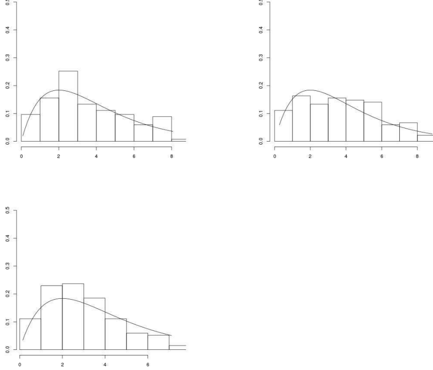
Figure 1: Histograms of n(\hat{\boldsymbol{\theta}}^{(k)} - \boldsymbol{\theta}_0)^T \Xi(\hat{\boldsymbol{\theta}}^{(k)})^{-1}(\hat{\boldsymbol{\theta}}^{(k)} - \boldsymbol{\theta}_0) , k = 1, \dots, 200 together with the density of a \chi_d^2 distribution. The considered experiment parameters were n = 500 and d = 4 . Upper left: (S2). Upper right: (S1). Bottom: (S3).

As it is seen from (18), this copula has a singular component. The authors chose to base the inference on the Kendall's tau (see Example 2). For \boldsymbol{\theta} in [0, 1]^d , the Kendall's tau coefficients are given by