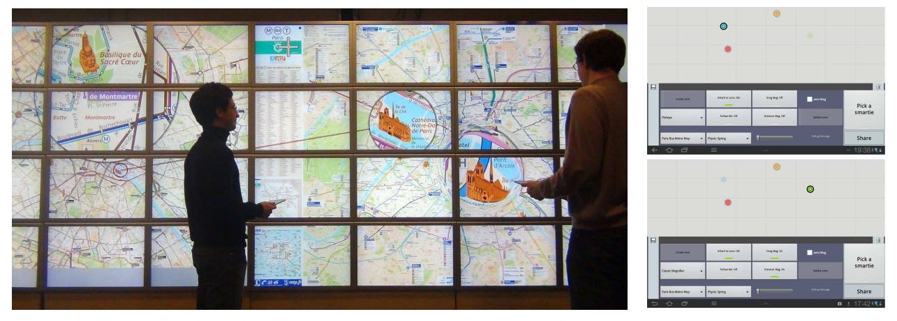
Figure 5. Left: Multiple Lenses, starting from the left a magnification lens, a DragMag and a fisheye. Right: the two mobile client interfaces running on tablets. The four pucks are attached respectively to a magnification lens (left of wall), the anchor and lens of a DragMag (middle) and a fisheye (right). The active puck is the blue for the device on top, and green for the bottom. The described widgets added by the application are seen on the widget area.

We grouped global widgets (i.e., independent of the active puck) at the bottom of the widget area. A drop down menu loads a new scene, and another sets the behavior of two lenses bumping each other. We use a 2D physical model where the lenses are considered as disks with their center attached to the ground with a spring. A global slider is used to change the strength of the spring from rigid, where bumping lenses don't move at all, to flexible, where they are pushed out of the way by other lenses and spring back when possible.