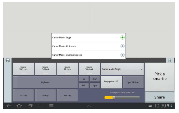
Figure 6. The mobile client running with the Smarties wall cursors application. A drop-down menu has been triggered by the top-left button of the widget area, to choose one of three replication modes.

Replication Extension: What came naturally to mind when testing this prototype was to replicate the interaction done in one screen to others. Our wall consists of 16 identical machines, each with two graphic cards driving two screens (30" and 2560 \times 1600 each). We added a drop-down menu to the client (Fig. 6) for choosing ways to replicate interaction done in one screen with a puck: (i) no-replication (as the examples so far); (ii) all-machine replication (i.e., on half of the screens); and (iii) all-screen replication.