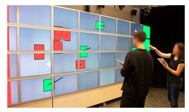
Figure 4. Participants collaborating and performing grouping by color.

In a second experiment we explored how users shared and reused pucks, refined their selections, and tagged sets of objects. The task was motivated by our biologists scenario: participants had to select groups of objects and then progressively refined these selections depending on different roles assigned to them. Optimal strategies led to exchanging selections by sharing pucks and keeping some selections alive