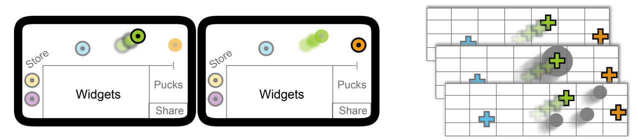
Figure 1. Left image: mobile device interface. The top area is taken up by multiple pucks. The bottom area has space reserved for (i) storing unused pucks; (ii) buttons for creating and sharing pucks; and finally (iii) an area for widgets customized by the wall application that can be associated to the active puck (green one here). The second image presents the view from another mobile device. Here the active puck is the orange one and the green one looks faded-out as it is unavailable. The last image shows possible presentation and behavior of the cursors on a wall display, controlled by these pucks. For example a moving puck can be associated with a simple moving cursor (top), moving an object (middle), or a group of objects (bottom).

puck attached to a text object can have shortcut action buttons for turning text bold, italic, etc. If we move this puck to another text editing object (even in another application) the same associated actions will still be available.