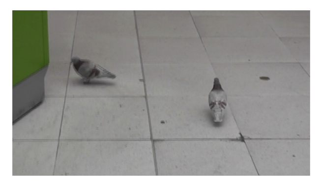
Fig. 3. Pigeons on patrol.

Such events, patterned movements and force-filled materialities sit in tension with the previously mentioned ambition for tranquillity through security and surveillance. It is questionable how comfortably guns and tranquillity go hand-in-hand given the police presence, and their questioning of undocumented persons that emanates a feeling that everyone is potentially under threat from these practices.