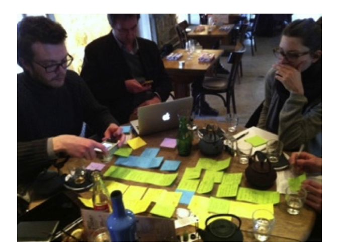
Fig. 2. (Re)constituting the field.