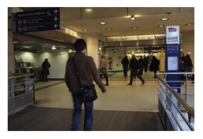
Fig. 5. Material manifestations of station management. Note the switch from a

wooden floor to a titled one, denoting a shift in the managerial jurisdiction for those areas of the station.