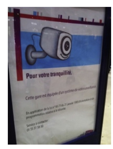
Fig. 1. 'Pour votre tranquillité'.

Responding to these questions, this paper emerges from the midst of a multi-site investigation into what we have called the 'sensory enigmas' of contemporary urban mobilities<sup>1</sup>. Drawing on a collaboration between British and French scholars from geography, urban studies and architecture that explores the case-studies of Paris Gare du Nord and St. Pancras International, London, this research has coalesced around a burgeoning set of conceptual and methodological approaches towards the investigation of 'atmospheres' and 'ambiences'. These approaches, having evolved largely independent of each other in the UK and France respectively, each offer us particular spatial, material and affective understandings of space, perception and experience which we want to suggest are crucial to the performance of security and how it is lived and, more specifically in this paper, are vital to how we can go about making sense of and researching those performances. This paper then goes some way towards exploring the providence of investigating atmospheres and ambiences by opening out a first conversation between both camps.