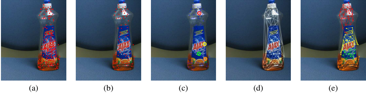
FIGURE 1 – Graph construction. (a) Initial SURF keypoints. (b) Filtered keypoints. (c) Seeds selection. (d) Delaunay triangulation over filtered feature points. (e) Graph-cuts result.

Keypoints Triangulation Next, a Delaunay triangulation is performed over the set \mathcal{P} . A connected graph is then generated for each image (figure 1(d)). It is composed of triangles built according the Delaunay constraint, i.e. by maximizing the minimal angle of the triangulation. Using this process, the spatial relationship between local features is invariant to image translation, scaling, and rotation.