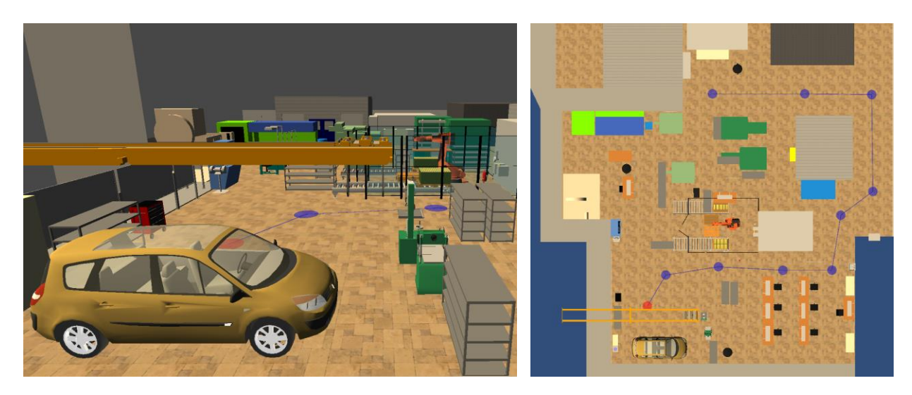
Figure 3 : The virtual environment used for the experiment