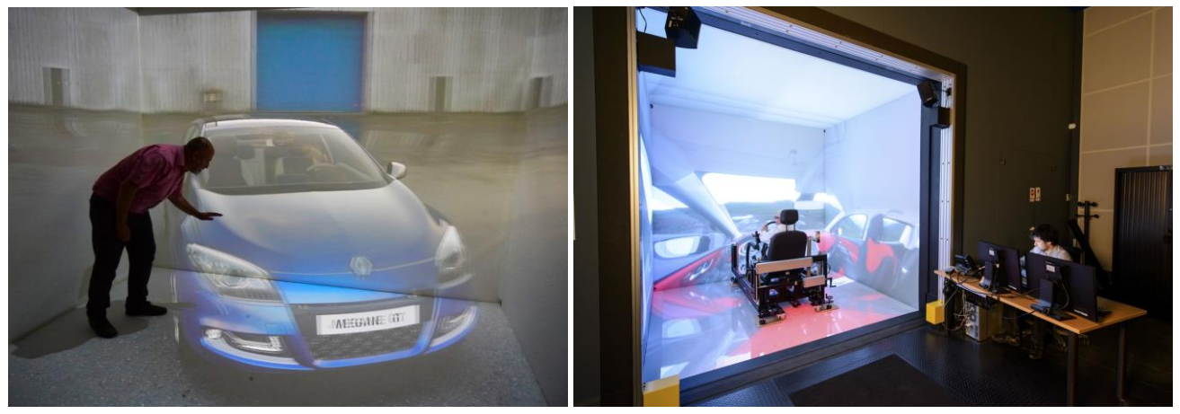
Figure 1 : Renault's test platform 2IP (left) and new IRIS CAVE (right)

In this paper, we present the results of an evaluation study we carried out comparing the friendliness and efficiency of the proposed smartphone-based interaction metaphor to a traditional technique and provide indications for more efficient choices for different use-cases.