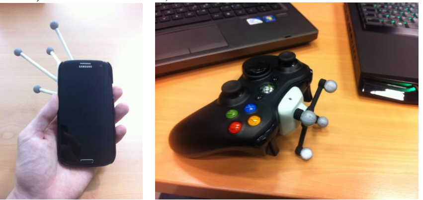
Figure 2: The peripheral used for the experiment with a body of tracking: a Samsung Galaxy SIII (left) and an XBOX 360 gamepad (right)

A simple scene was constructed for the purpose of the experiment. It consisted of a fictive Renault's automobile assembly plant (30 m \times 20m) with realistic distances, sizes. The different routes to follow covered the entire scene.