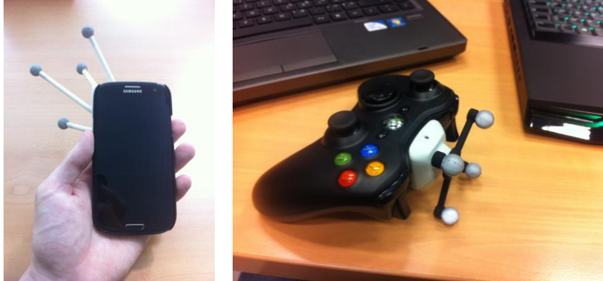
Figure 2 : The peripheral used for the experiment with a body of tracking: a Samsung Galaxy SIII (left) and an XBOX 360 gamepad (right)

A simple scene was constructed for the purpose of the experiment. It consisted of a fictive Renault's automobile assembly plant (30 m × 20m) with realistic distances, sizes. The different routes to follow covered the entire scene.