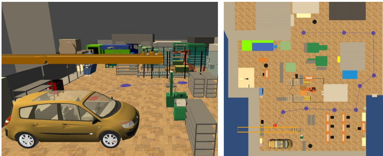
Figure 3 : The virtual environment used for the experiment