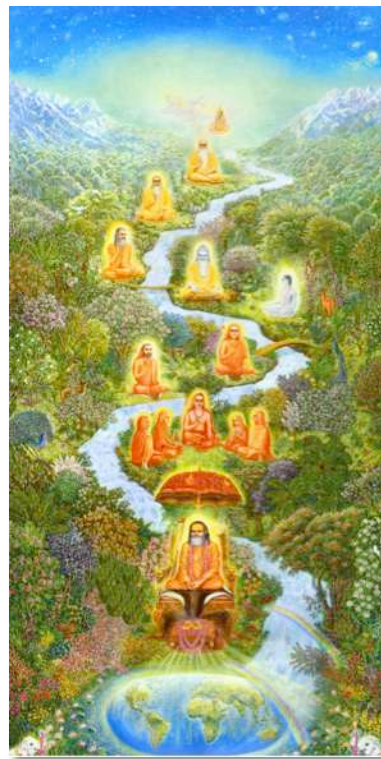
Figure 2: Picture of The Art of Living's Advaita guru paramparā .