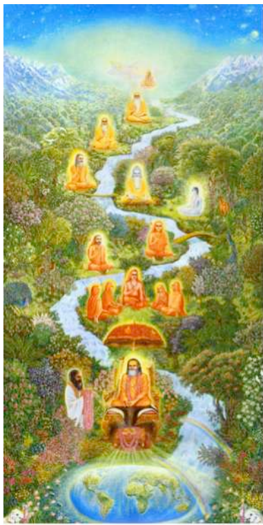
Figure 1: Picture of the Transcendental Meditation's Advaita guru paramparā .

Inscription within a paramparā is, however, not the only way Sri Sri Ravi Shankar uses tradition as a resource of legitimacy. He is also fully integrated into the Hindu traditional landscape thanks to the many contacts and friendships he has made with leading figures of the Hindu traditions. Recognition by peers is also an important step in the process of legitimizing the authority of the charismatic guru. Sri Sri Ravi Shankar regularly receives in his ashram in Bangalore saints and leaders of various Hindu traditions, as in January 2003 during the so-called World Conference On Spiritual Regeneration and Human Values , organized on the occasion of the inauguration of the conspicuous meditation hall, The Vishalakshi Mantap . Moreover, repeatedly, the founder of The Art of Living Foundation has appeared publicly with a prominent figure of traditional Hinduism, the Shankaracharya of Kanchi (Jagadguru Shankaracharya Sri Jayendra Saraswati Swamiji). The master, also, shows himself with spiritual leaders of other traditions, like the Dalai Lama. This kind of meeting, highly publicised, with a spiritual leader like the Dalai Lama who enjoys an international audience, gives to Sri Sri Ravi Shankar a spiritual legitimacy not only in India but also in the rest of the world where traditional Hindu figures remain relatively unknown.