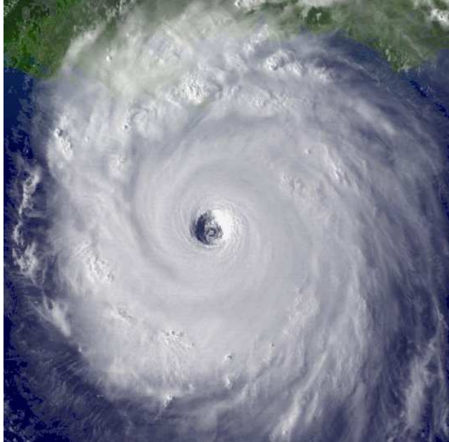
FIGURE 2 – Example of X(t) for p = 1.28

Now we verify the relation (1.8) on the picture of the vortex of a hurricane Katrina.