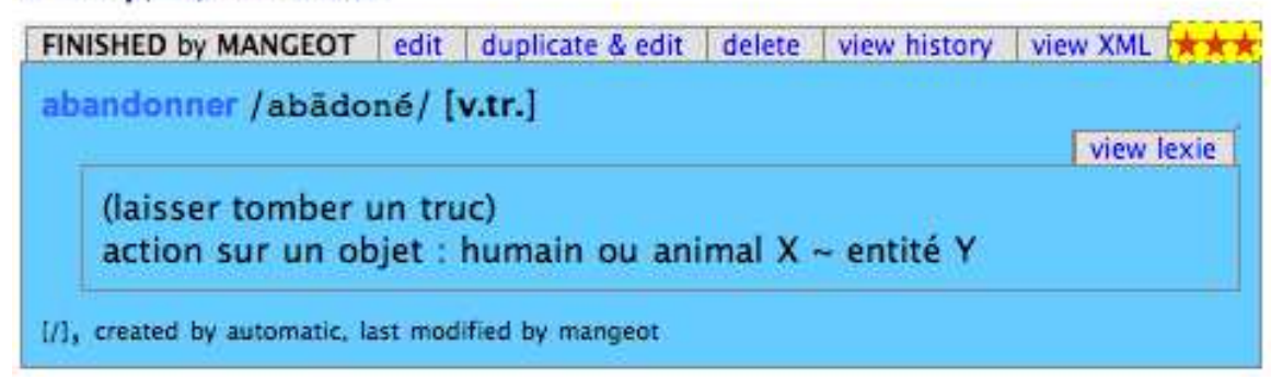
Fig. 2. 3-star rated entry on the Jibiki platform

directly into the graphic interface of the collaborative software tools.