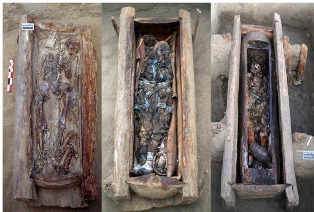
Figure 2. Graves of three frozen bodies from Yakutia. Bodies were autopsied and diagnosed as having bone tuberculosis: Graves of Okhtoubout 2, Kyys Ounhouogha and Bakhtakh 3 respectively. doi:10.1371/journal.pone.0089877.g002

The palaeoepidemiological study was undertaken after grouping the TB and non-TB subjects into time periods [33]. Prevalence was calculated as the number of individuals presenting the disease divided by the number of individuals in the study population. Crude Prevalence Rate (CPR) was calculated for each time period sub-unit: the number of individuals with the disease was divided by the number of individuals in each period sub-unit. The