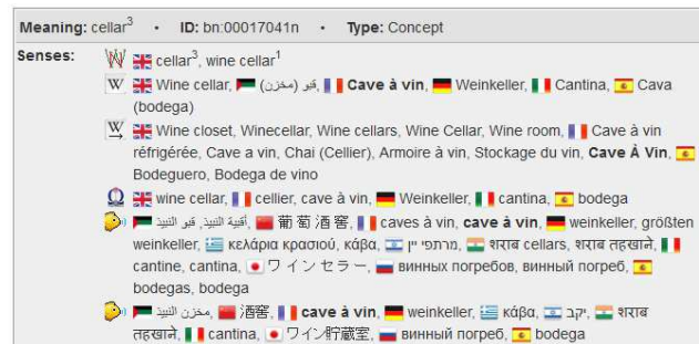
Figure 2: Synset bn:00017041n in BabelNet’s online search interface.

Our second objective is to map aligned Alsatian variants to BabelNet synsets. For instance, taking the example of Figure 1, the cluster formed by [“Winkällér”, “Winkeller”, “Winkaller”] should be mapped to the synset with ID bn:00017041n (see Figure 2).