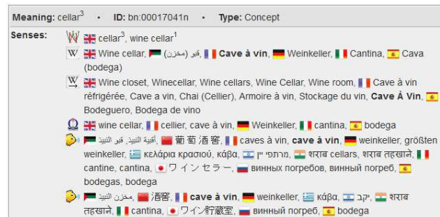
Figure 2: Synset bn:00017041n in BabelNet’s online search interface.

Our second objective is to map aligned Alsatian variants to BabelNet synsets. For instance, taking the example of Figure 1, the cluster formed by [“Winkällér”, “Winkeller”, “Winkaller”] should be mapped to the synset with ID bn:00017041n (see Figure 2).