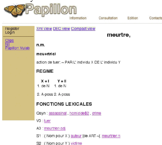
Figure 4. French entry "meurtre" dynamically displayed using Mel'cuk's classical view

encoded as a XSL stylesheet that is applied on the result of each user query. In the future, we will also allow users to define their own custom views and store them on the server. All these transformations are done on the server in order to allow users to use their preferred browser (even if it is not XML aware). Figure 4 shows an example of the French entry "MEURTRE" (murder) viewed as in Mel'cuk's DEC dictionary.