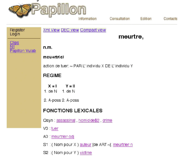
Figure 4. French entry "meurtre" dynamically displayed using Mel'cuk's classical view

encoded as a XSL stylesheet that is applied on the result of each user query. In the future, we will also allow users to define their own custom views and store them on the server. All these transformations are done on the server in order to allow users to use their preferred browser (even if it is not XML aware). Figure 4 shows an example of the French entry "MEURTRE" (murder) viewed as in Mel'cuk's DEC dictionary.