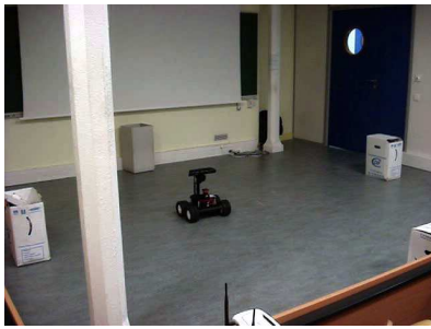
Fig. 4. Second experiment field

2) Circular trajectory : The second experiment consists of executing a circular trajectory in the environment shown in Figure 4. The test area was surrounded on all sides by a bounding wall, and a number of visual landmarks were placed around the test area to provide better scan matching conditions during turning maneuvers. The robot began stationary, executed two concentric counter-clockwise circles with a constant velocity, and then stopped at its initial position. The overhead position estimates from the IEKF are plotted against the LiDAR-derived reference trajectory in Figure 5.