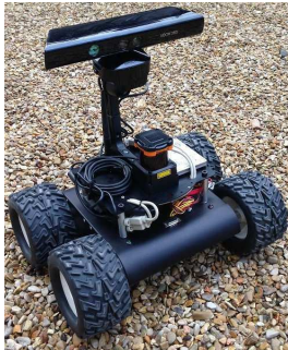
Fig. 1. The Wifibot Lab v4 Robot

The wheeled robot used for our experiments is shown in Figure 1. The robot is equipped with an Intel Core i5-based single-board computer, WLAN 802.11g wireless networking, all-wheel drive via 12V brushless DC motors, and a Kinect camera providing 3-D point cloud scans of the environment. The odometry data at 50 Hz and Kinect point clouds at 5 Hz are passed to the IEKF which estimates the plane position (x, y) and heading angle \psi of the vehicle. The robot is also equipped with a Hokuyo UTM-30LX LiDAR which provides centimeter-level positioning accuracy through proprietary SLAM code [26]. This LiDAR-derived data is used solely to provide a reference trajectory when plotting results.