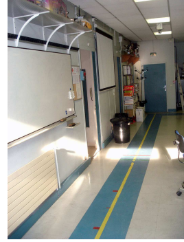
Fig. 2. First experiment field

1) Straight line trajectory : The first experiment field is the laboratory shown in Figure 2. The robot begins stationary at the bottom edge of the picture then advances with constant velocity in a straight line along the marking on the floor towards the far door, where it comes to a stop. The motion was commanded in open-loop and the robot's trajectory exhibited a slight veer to the left over the full length. The state estimates by the IEKF are plotted against the LiDAR-derived reference states in Figure 3.