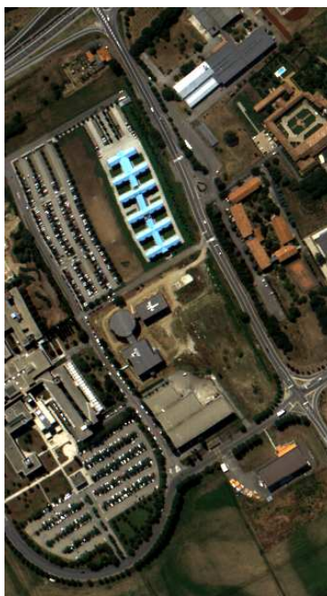
Figure 3: False color representations of the Pavia University dataset.

Figs. 3 and 4 show false color representations of the actual Pavia University dataset and the super-resolution estimated images obtained by the compared approaches.