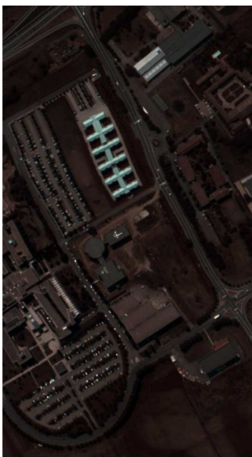
Figure 3: False color representations of the Pavia University dataset.

Figs. 3 and 4 show false color representations of the actual Pavia University dataset and the super-resolution estimated images obtained by the compared approaches.