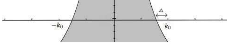
FIGURE 2. Discretisation at fixed w > 0 and L > 0