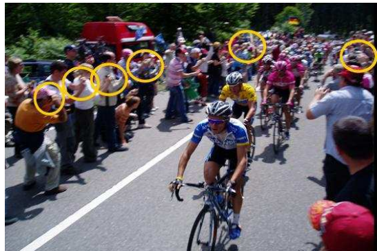
Figure 1: Bicycle use-case

network services such as regional multicast distribution can be invoked where most needed to relieve congestion and improve the Quality of Experience (QoE) for the users.