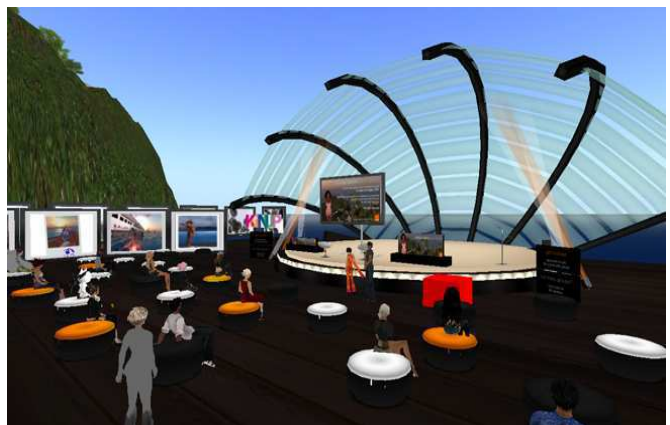
Figure 2: 3D virtual conference

A second example is a virtual meeting such as a 3D virtual conference, where a large number of participants, represented by virtual avatars, can meet and communicate via voice, avatar gestures as well as share additional multimedia data such as live video, 3D models, text and presentation slides (figure 2). Participants can move around the virtual meeting space, attend presentations, establish special interest discussion groups, socialise in coffee breaks, etc. Tracking the participants and managing their interests and participation in various activities is the responsibility of the application overlay only, however the distribution of content to various groups of users is something that benefits by the cooperation with the underlying networks. Users in the same virtual meeting room with a similar point of view need access to similar data, such as static background material as well as dynamically changing objects that need to be synchronised between many consumers. The efficiency of the system can therefore be greatly improved by organising the overlay with regards to the position of content within the virtual space and making use of ISP-provided network services such as localised in-network content caching or multicast for distributing state changes of common objects to reduce latency in live updates, reduce network load and therefore costs.