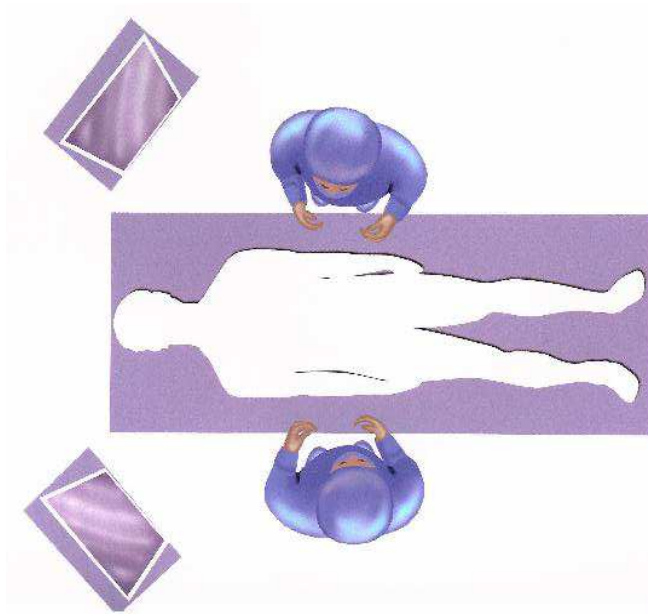
Figure 2. Example Orientation of Surgeons and Laparoscope Displays around Patient Table

during a typical laparoscopic cholecystectomy procedure is described in Jones et al. [28].) The observed cases included three different surgeons (four surgeries of each surgeon) and six different fourth year residents in different combinations of the two groups. The video collected included both the external video captured on a handheld video camera and the internal video captured by the laparoscopic recorder. For data analysis purposes, we combined the two video windows into a synced picture-in-picture format, which allowed us to simultaneously review the surgeons' actions both in and out of the body (Figure 1). As a further step in data collection and validation, the surgeons were presented with findings and given opportunities for comment during interviews.