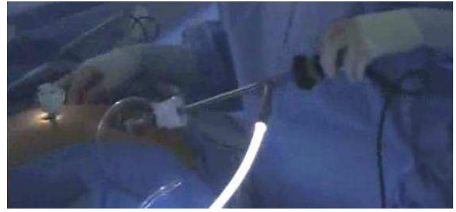
Figure 3. Palpating and Orienting

This process of palpating in order to see the resulting movement of tissue is a mechanism of connecting one’s orientation and movement on the outside of the body to the resulting location on the inside of the body (Figure 3). The first step sets the stage not only with the ideal location of ports for conducting the surgery, but also with a working