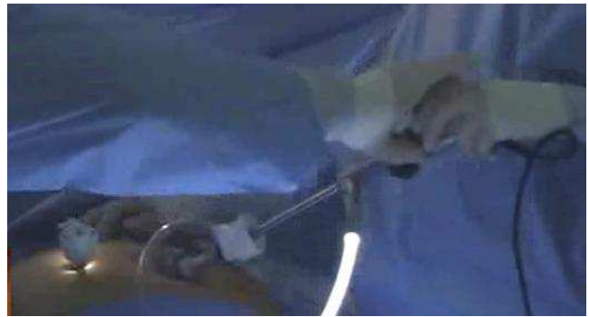
Figure 4. Guiding the Hand.

In all of the examples, the surgeon is revealing anatomy to the trainee in order for the resident to see what the surgeon