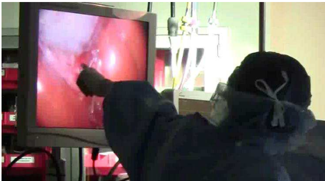
Figure 5. Guiding the Eye.

meant was go underneath it so you don't burn the gallbladder."