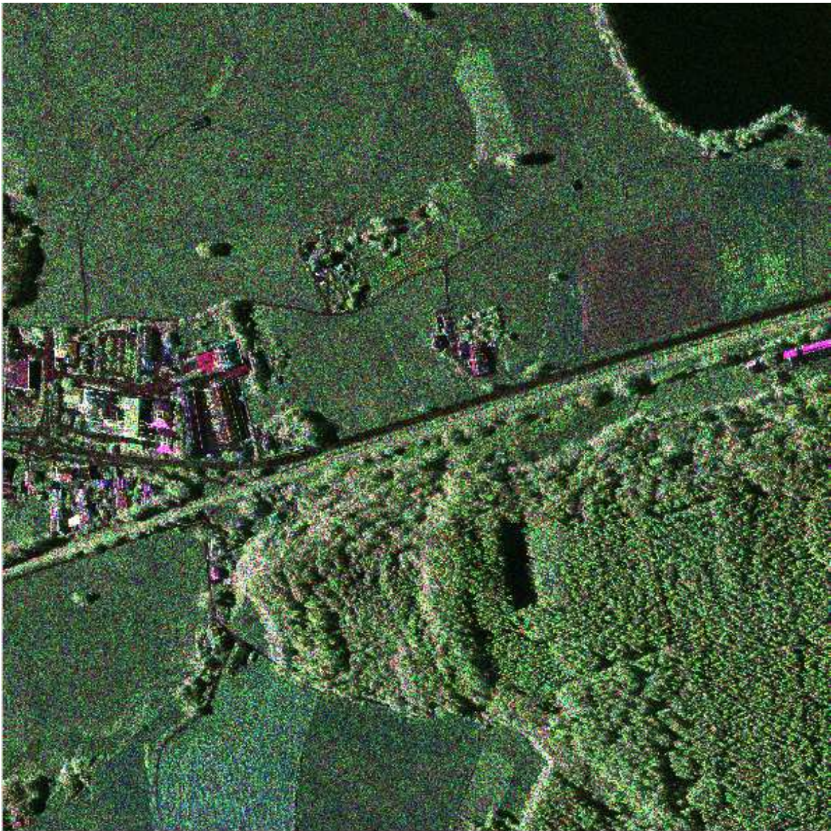
Fig. 1. Polarimetric FSAR X-band image with size 5000 \times 5000 over Kaufbeuren site, Germany. The sensor used for this acquisition operates in the spectral X-band, has altitude 3045 meter and offer a pixel spacing of 15 centimeter in range and 17 centimeter in azimuth.