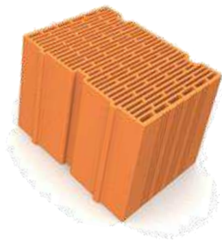
Figure 1: A typical mono-wall brick

Among different solutions which are proposed to the builders, one consists to use adapted building elements, such the specific bricks called mono-wall blocks , which have the particularity to ensure both the function of a brick (or a breeze block), and the one of insulation. Besides, this permits a time gain because these elements are easy to implement. In summary, this element is a brick made of terra-cotta and has an alveolus structure material which ensures the insulation (figure 1).