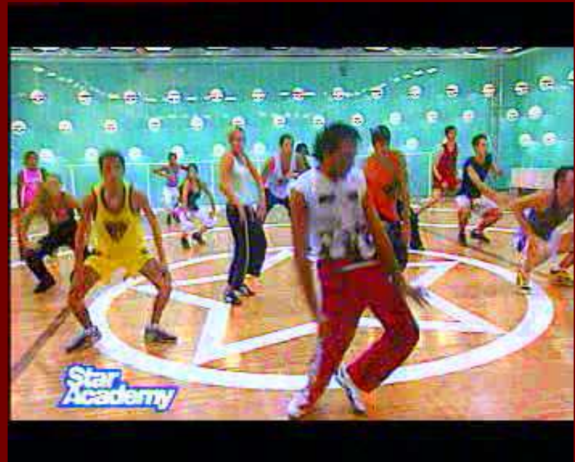
The sports and dancing lessons