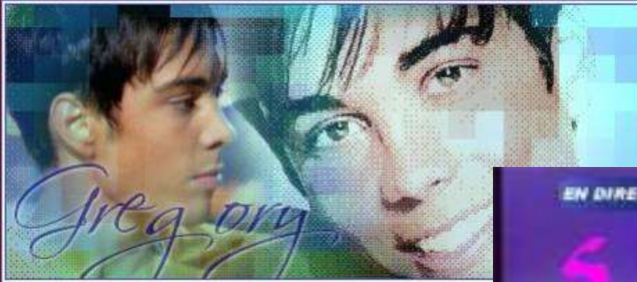
Edited from candidates' photos