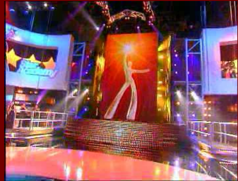
Re-using the logo