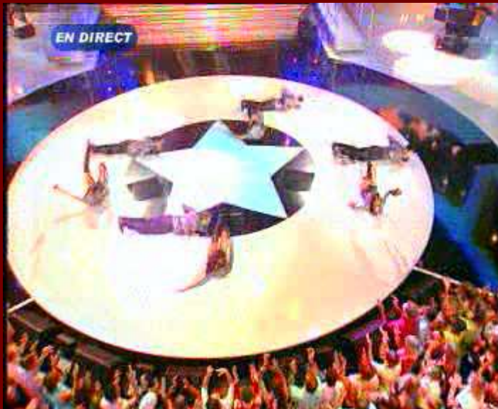
Re-using the star motif