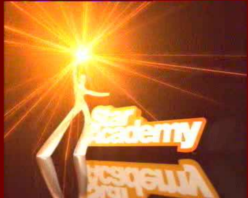
Screen capture of the logo in the programme

The transferred images work both as indexes of a televisual content and as symbols of the programme.