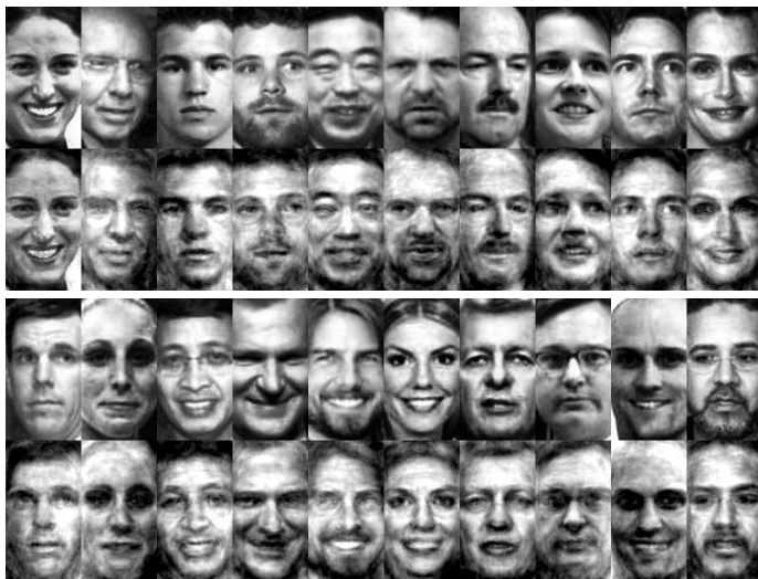
Figure 2: Reconstructing LFW images. Top rows are real faces while bottom ones are faces reconstructed with a decoder trained with 3000 training images.