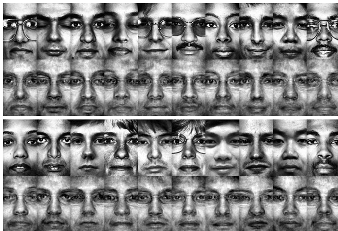
Figure 1: Reconstructing FERET images. Top rows are real faces while bottom ones are faces reconstructed with a decoder trained with 921 training images.

in pose, expressions and lighting conditions. This makes LFW much more challenging than FERET.