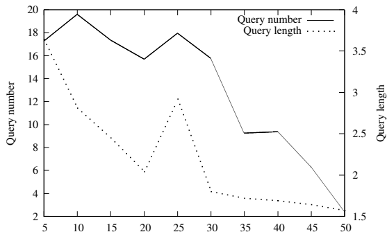
Figure 2: Results as a function of m with n = 50, k = 10 .

The inequality is redundant if and only if the resulting optimal value is not lower than d . Each previous inequality of \mathcal{K} may be tested for redundancy so as to keep the size of the representation of the agent’s knowledge minimal. This however comes at the cost of solving |\mathcal{K}| LPs each time an inequality is added, where |\mathcal{K}| is the number of inequalities in \mathcal{K} .