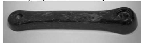
Figure 1: pedal crank made with recycled Carbon Fibres (developed at I2M) (Perry 2012)]

In order to integrate LCA information into the product design stage, necessary information must be properly represented and associated to the product PLM information. In the proposed research, a case study was first conducted to examine what LCA information should be modeled. Composite parts give interesting examples on a simple piece such as a pedal crank developed with recycled carbon fibers for thermoset organic matrix composite as shown in Figure 3. During the design, product models have to integrate materials information such as matrix composition, reinforcement type (glass, carbon, aramid, and natural), their architecture (unidirectional, woven) and the structure composition (orientations of the different layers in the depth of the product). Other information like inserts or coating completes the bill of material. Currently in STEP AP 203, only very limited material information is modeled as shown in the following entities in table 1. To associate composite material information to a product design, the following entities were developed in this research. The new entities are written in bold-italic.