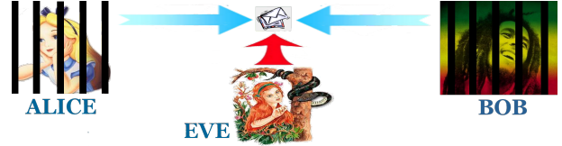
Figure 2. Simmons' prisoner problem [11]

Definition 7 (Security [9]): Watermarking security refers to the inability by unauthorized users to have access to the raw watermarking channel [...] to remove, detect and estimate, write or modify the raw watermarking bits. \square