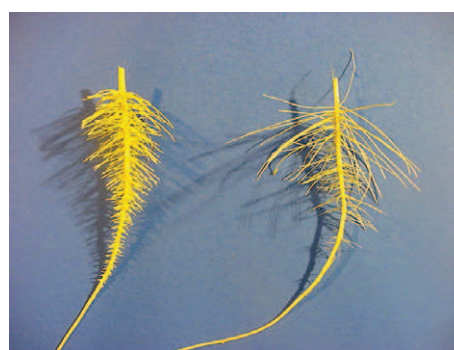
Fig. 2. Effect of HLS (left) on lateral root emergence in comparison with control (right).

The nutrient solution consumption of maize plants treated with HLS was higher than that of plants grown in the reference solution (Table 4). The mean quantity of water consumption was 23.7 L per plant with the HLS treatment versus 16.2 L for the reference solution. On the other hand the water efficiency of these plants (calculated by dividing