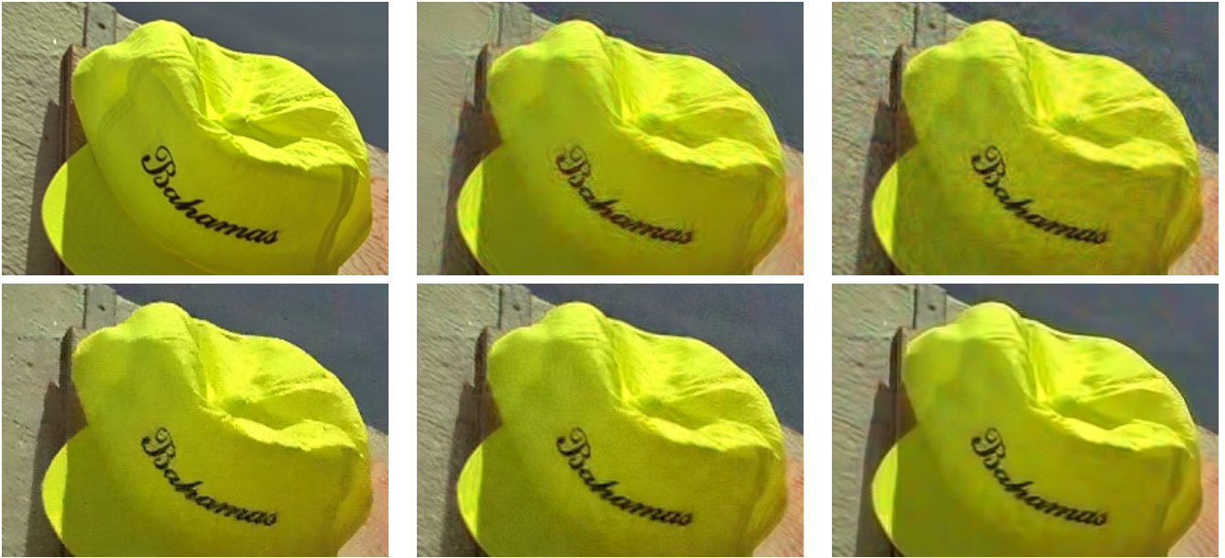
Fig. 2. From top left to bottom right: part of the ground-truth image no. 3 of the Kodak base, parts of the denoised images with the methods [3], [5], [6], [11]+[17], proposed. The noise level was \sigma = 20 .

opens the door to real-time high-quality denoising. The proposed framework can also be extended to other CFAs [20].