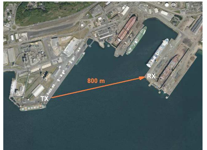
Fig. 2. Sea trials area.

A view of the area where the experiments were conducted is shown in Fig. 2.