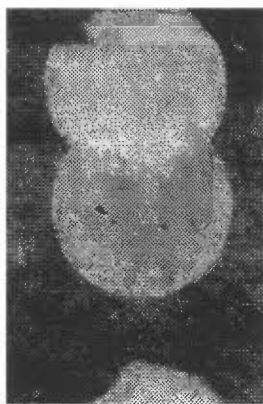
Figure 2 : Ceramic cleaned by Nd:YAG first harmonic (middle circle) and third harmonic (bottom circle)