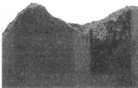
Figure 4 : Changed of coloration on a rough clay ceramic

Acknowledgements: Arc'Antique analysed the results of the first tests conducted in 1997 in FORTH (Crete) with different types of lasers through a program financed by the LUF (Laser Ultraviolet Facility). This program has benefited from multi-year financial assistance of C2RMF (Centre de Restauration et de Recherche des Musées de France).