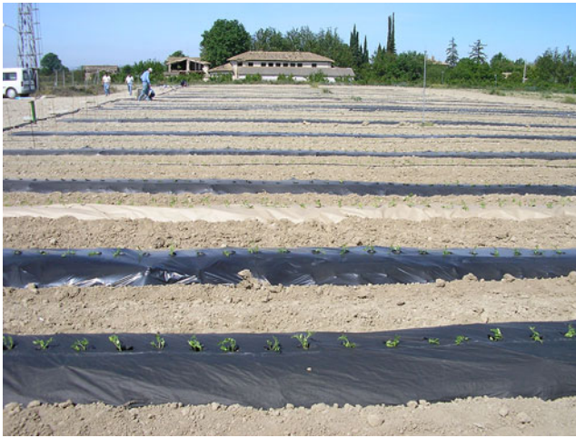
Fig. 1 View of one of the field trials where different biodegradable mulching materials were tested at Almodévar, Aragón, in 2007

biodegradable plastic mulch (black Biofilm©, 17 \mu\text{m} thick), (6) oxo-degradable plastic mulch (black Enviroplast©, 15 \mu\text{m} thick), (7) paper mulch (black MimGreen©, 85 \text{g m}^{-2} ), (8) paper mulch (brown Saikraft©, 140 \text{g m}^{-2} ), (9) barley straw (1 \text{kg m}^{-2} ). Barley straw was provided locally and the dose was determined in previous experiments (Anzalone et al. 2010). Straw was applied 10 days after transplanting.