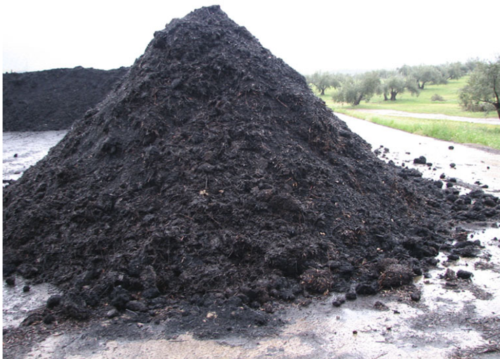
Fig. 1 Visual aspect of composted olive mill pomace

The objective of this field study was to evaluate the cumulative effects (from 3 to 16 years) of repeated applications of composted olive mill pomace on the soil physico-chemical properties and the soil's potential capacity to degrade organic compounds (i.e., soil enzyme activities).