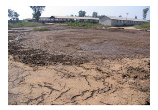
Fig. 4 Waste treatment of scaled livestock breeding

domestic sewage in treatment works. Antibiotic residues have been frequently detected in sewage, activated sludge, digested sludge, and urban biosolids (Zhang and Li 2011); the presence