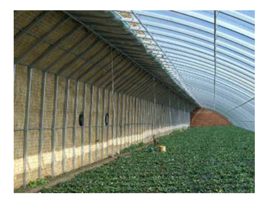
Fig. 2 Typical Chinese solar greenhouse for vegetable cultivation