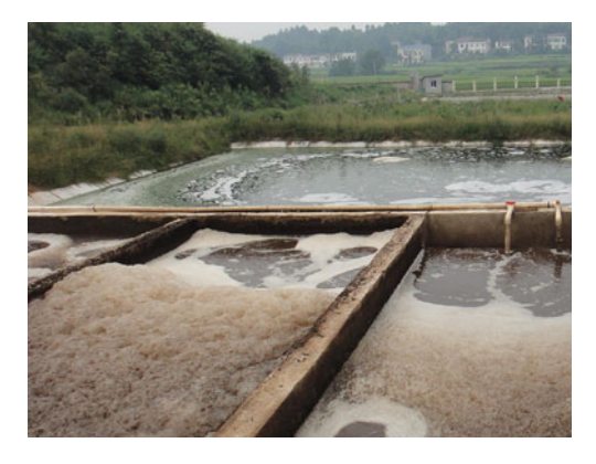
Fig. 5 Wastewater treatment of scaled livestock breeding

Antibiotics could enter aquatic environment through urban sewerage systems and wastewater of livestock breeding (Fig. 5), and runoff and leaching from terrestrial ecosystems. Certainly, antibiotics in aquatic environment could be transported into agro-ecosystems via irrigation and sedi-