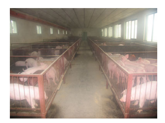
Fig. 3 Typical scaled livestock breeding in China

Urban biosolids are a source of antibiotic contamination for the agro-ecosystem because these substances are usually employed in agriculture. Biosolids refer to solid, semisolid, and liquid residues that are generated during the treatment of