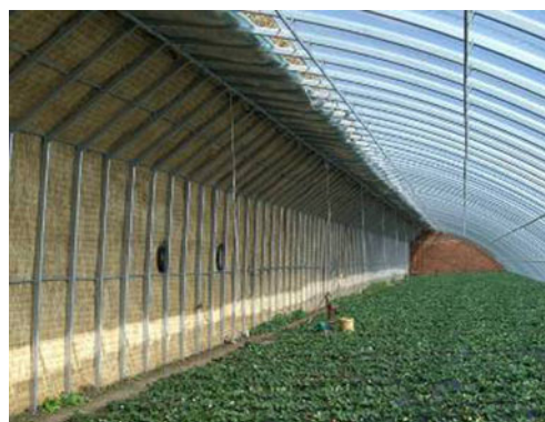
Fig. 2 Typical Chinese solar greenhouse for vegetable cultivation