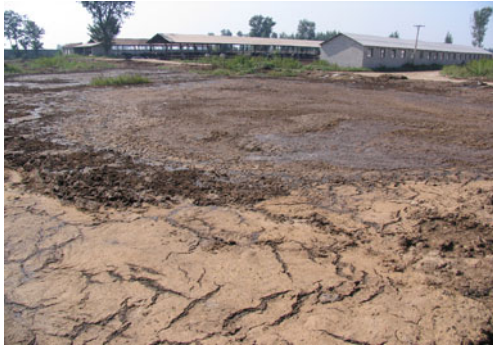
Fig. 4 Waste treatment of scaled livestock breeding

domestic sewage in treatment works. Antibiotic residues have been frequently detected in sewage, activated sludge, digested sludge, and urban biosolids (Zhang and Li 2011); the presence