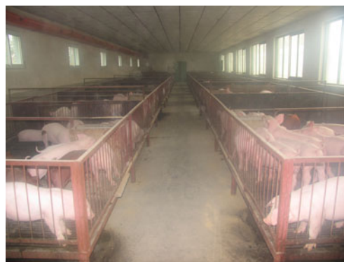
Fig. 3 Typical scaled livestock breeding in China

Urban biosolids are a source of antibiotic contamination for the agro-ecosystem because these substances are usually employed in agriculture. Biosolids refer to solid, semisolid, and liquid residues that are generated during the treatment of