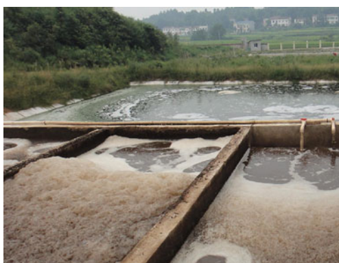
Fig. 5 Wastewater treatment of scaled livestock breeding

Antibiotics could enter aquatic environment through urban sewerage systems and wastewater of livestock breeding (Fig. 5), and runoff and leaching from terrestrial ecosystems. Certainly, antibiotics in aquatic environment could be transported into agro-ecosystems via irrigation and sedi-