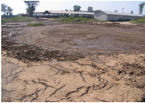
Fig. 4 Waste treatment of scaled livestock breeding

domestic sewage in treatment works. Antibiotic residues have been frequently detected in sewage, activated sludge, digested sludge, and urban biosolids (Zhang and Li 2011); the presence