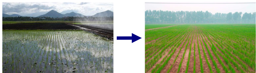
Fig. 1 Cultivation shift from flooded to aerobic rice production system

Zinc deficiency is frequently reported not only in traditional lowland rice (Dobermann and Fairhurst 2000), but also in upland or aerobic rice production, such as on Oxisols and Ultisols in Brazil (Fageria 2000), and on calcareous soils in China (Gao et al. 2006). Zinc solubility and availability to plants differs between flooded soils and aerobic soils. If the conversion of flooded to aerobic rice production occurs in areas where Zn availability to the crop is likely to be at risk, there is a danger of reducing productivity not only because of less available water but also because of Zn deficiency. For example, Giordano and Mortvedt (1974) and Wang et al. (2002) reported that Zn-deficiency symptoms were more pronounced in plants grown on aerobic soils as compared to anaerobic soils. An