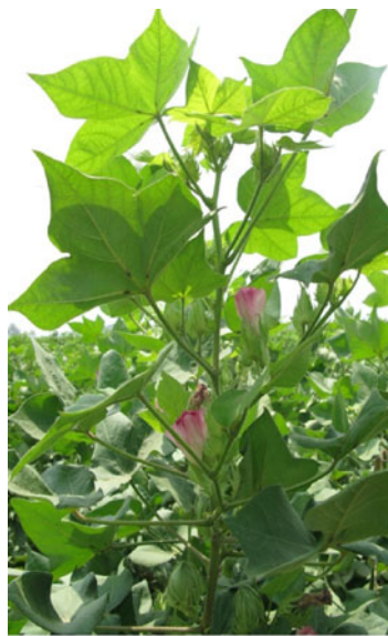
A: Healthy cotton plant