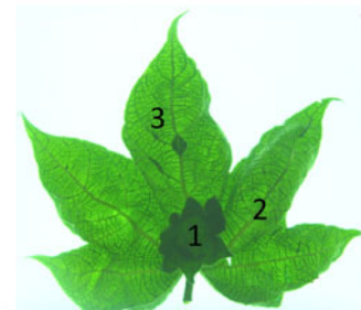
D: Infected leaf (1= Enation; 2= Large Veins thickening; 3= Small veins thickening)

Artificial populations, usually from crosses between two inbred parents, are in very strong linkage disequilibrium. Natural populations are usually the products of many cycles of recombination, and have the potential to pinpoint QTLs to high resolution using “association mapping” (Varshney et al. 2006). Mapping of gene which control complex traits is done with nested association mapping (NAM) which is comparatively a new approach (Fig. 4). In this method the statistical power of mapping QTLs and the high (potentially gene-level) chromosomal resolution of association mapping is combined. Populations used in NAM are “nested” as these populations share one parent common. However, each population has another alternate parent. In NAM, a possible number of (e.g., about 1,000–2,000) mutual SNPs which are parent specific are genotyped along with genotyping of the parents with a super resolution (e.g., by sequencing the entire genome). Common parent-specific SNPs are used to characterize each chromosomal segment defined in each segregant according to whether it derives from the common parent or the alternate parent. Like this, high-resolution