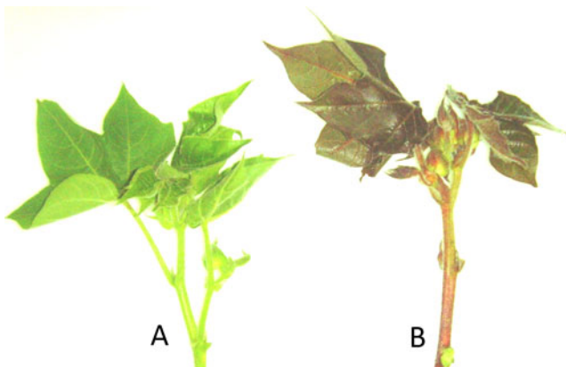
Fig. 3 Comparison between green and red leaf color. a Green leaf color, b red leaf color

Targeting induced local lesions in genomes (TILLING) is an effective and widely applicable approach for identifying the functions of genes through developing a knock-out population by exposing the seed with a mutagen such as EMS. Preliminary work has been done to introduce TILLING in diploid cotton ( Gossypium arboreum ) (Auld et al. 2009).