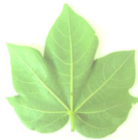
B: Healthy cotton leaf