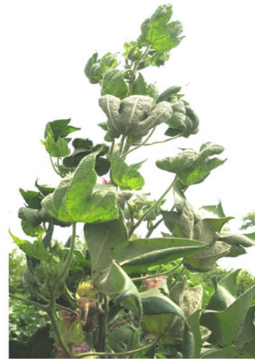
C: Infected cotton plant With cup shaped leaf structure