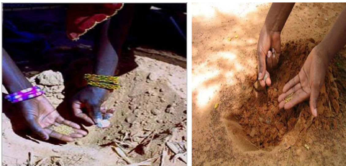
Fig. 8 Fertilizer placing under the micro-dosing, Niger

There is a common misconception that supporting the use of manufactured fertilizers means opposing the use of organic sources of nutrients. Nothing could be further from the truth. Most agronomists agree that optimal nutrient management entails starting with on-farm sources and