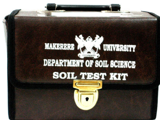
Fig. 5 Soil test kit from Makerere University, Uganda

This section reviews the role of plant nutrients and fertilizers in soil fertility maintenance and crop production. The issues examined include the supply of plant nutrients, crop yield and land use efficiency, compensation for lack of nutrients from other sources, and fertilizer repackaging. More details are given below.