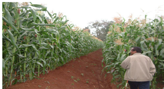
Fig. 9 Effect of balanced nutrition on maize performance, Kenya

Nutrient interactions influence crop yields. Alley and Vanlauwe (2009) demonstrated the maize grain yield response to applications of P at various levels of applied N. Although the shapes of the yield response curves to increasing rates of P were similar at different N levels, the yields were very different, showing how N was limiting the