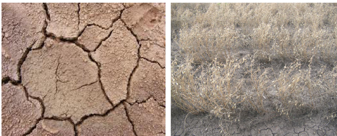
Fig. 3 Highly degraded soil

tives did little to promote the welfare of the farmers (Eicher 1999). Under the structural adjustment of the 1980s and 1990s, these monopolistic cooperatives were either disbanded or privatized, affecting their input subsidy programs (IFDC 2003; Smaling et al. 2006). Following this disbandment, there were too few private investors to fill the vacuum in input supply (Jayne et al. 2002; Omamo and Farrington 2004). With the ensuing poor prices for farm produce and poor agricultural infrastructure, smallholder farmers felt abandoned.