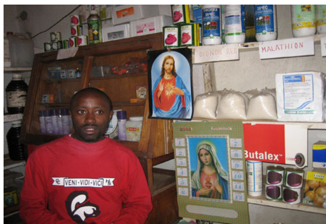
Fig. 6 Agro-input shop, Bukavu, DR Congo

deposits constitute a potential source of P needed to address nutrient limitations and could be utilized to replace the expensive imports (Sanchez et al. 1997; van Kauwenberg 2006). Many of the sedimentary and igneous deposits can be used in the raw or semi-processed form, especially if combined with organic resources. However, sedimentary and igneous deposits vary greatly in nutrient concentrations and solubility. Africa must, therefore, improve upon its capacities to increase the solubility of less-reactive rocks through co-granulation or partial acidulation. Plans must also be developed for the better distribution and marketing of phosphate rock in areas with widespread P deficiency. Like phosphate rock, local deposits of other agro-minerals occur throughout Africa, particularly of limestone, dolomite and gypsum that effectively correct pH, calcium, magnesium, and sulfur imbalances in the soil. These are often mined for industrial purposes not involving fertilizer production. Clearly, benefit will be obtained from assessing the agronomic potential of current industrial by-products containing plant nutrients and then informing land managers of their comparative advantages.