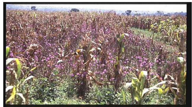
Fig. 2 Striga weed infestation due to soil fertility depletion, Kenya