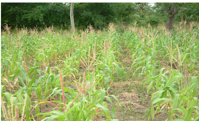
Fig. 1 Effect of soil fertility depletion on productivity, Kenya

An important component of the development strategies of newly independent African nations during the 1960s and 1970s was the establishment of agricultural cooperatives (Lynam and Blackie 1994). Directed through parastatal boards that were subject to political influences, the cooperatives were designed to promote the export of commodities. There was distrust, because these coopera-