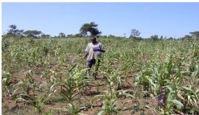
Fig. 7 A very poor soil so fertilizer use might be unprofitable

As elsewhere, efficiency in the use of fertilizers or other nutrients is critical for the overall improvement of Africa.