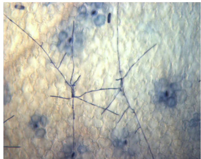
Fig. 3 E. pisi colony growing in a pea leaf

In lines containing Er3 gene, most of the E. pisi conidia are able to penetrate the epidermal pea cells and form