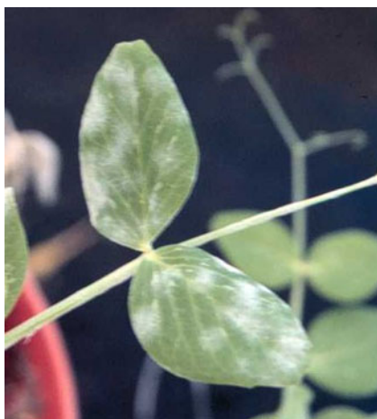
Fig. 1 Powdery mildew symptoms in a pea leaf

Powdery mildew of pea is caused by E. pisi in the past, often reported as Erysiphe communis auct. p.p. or Erysiphe polygoni auct. p.p. Braun (1987) differentiated E. pisi var. pisi infecting species in Pisum , Medicago , Vicia , Lupinus