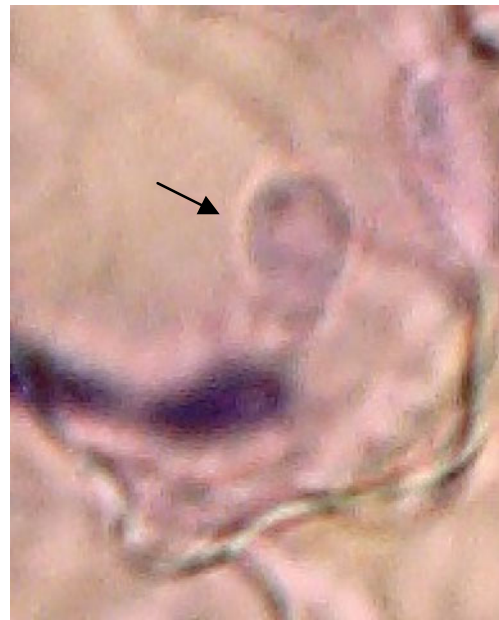
Fig. 2 E. pisi haustorium formed in a pea epidermal cell

Resistance conferred by er2 gene is influenced by temperature and leaf age so that complete resistance is only expressed at 25°C or in mature leaves. Resistance governed by er2 gene at high temperatures is due to the occurrence of hypersensitive response in established colonies (Fig. 4). In adult leaves, resistance is due to a reduction of colony establishment in addition to the presence hypersensitive response in established colonies (Fondevilla et al.