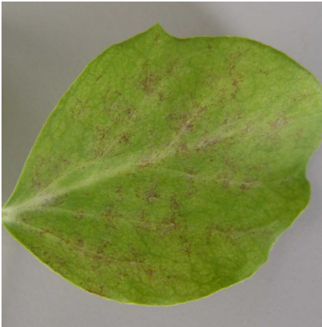
Fig. 4 Hypersensitive response observed in a JI2480 leaf inoculated with E. pisi and incubated at 25°C for 7 days

secondary hyphae, but the growth of these established colonies is stopped by a strong hypersensitive response (Fondevilla et al. 2007a, b; Fig. 5).