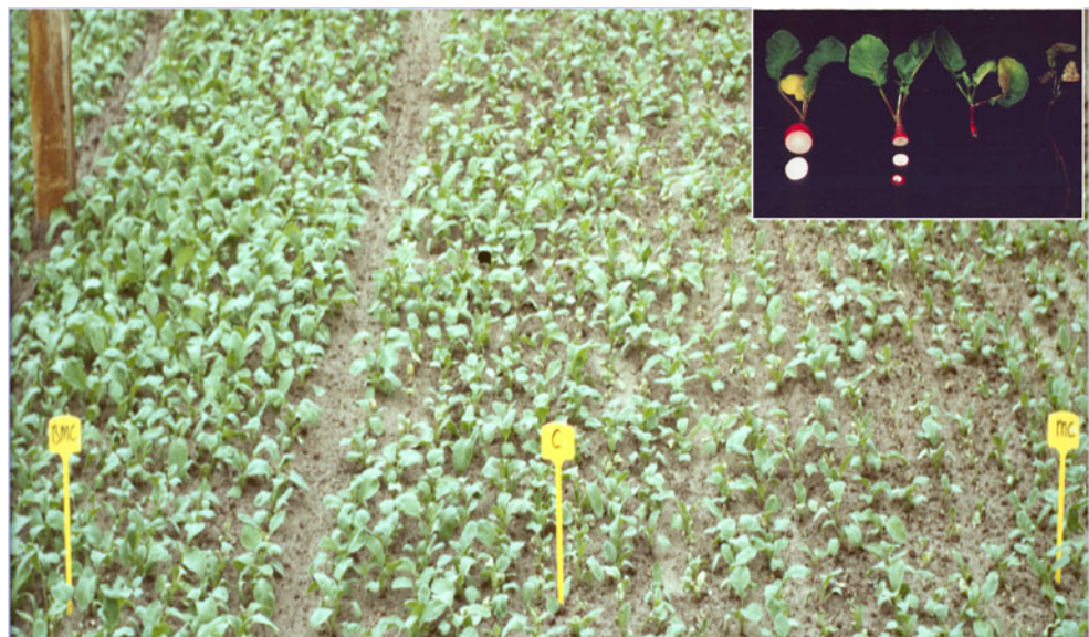
Fig. 1 Control of Fusarium wilt of radish by a seed-coating treatment with Pseudomonas fluorescens WCS347 in a commercial greenhouse that was naturally infested with Fusarium oxysporum f. sp. raphani . Plants on the right hand side were grown from seed not treated (C) or treated with just a coating (MC), and plants on the left from seeds coated with the pseudomonas bacteria. (Leeman et al. 1995a). The inserted picture shows details of symptoms of Fusarium wilt of radish (left, healthy; right, completely wilted and dead)

Can suppress various soilborne diseases, for example Fusarium wilt in carnation (Duijff et al. 1994) and radish (Raaijmakers et al. 1995; De Boer et al. 2003). Because of its extremely low solubility, iron is often a limiting element in the soil and rhizosphere. Hence, most microorganisms secrete siderophores that chelate iron which is subsequently acquired through membrane receptors (Loper and Buyer 1991; Neilands 1995). Under iron-limiting conditions, WCS358 secretes the fluorescent siderophore pseudobactin-358. Iron chelated by pseudobactin-358 is taken up by a