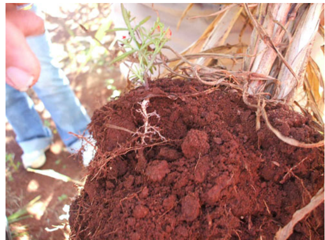
Fig. 10 Attachment of S. asiatica haustoria to upland rice roots (Madagascar)

Viable seeds of the witchweeds ( Striga spp., parasitic plant species that dramatically affect cereal crop production in Sub-Saharan Africa), which may remain dormant in the soil for many years, will usually not germinate unless exposed to chemical compounds exuded from the roots of a host plant and certain non-host plants. One such compound, strigol, was isolated from the root exudates of cotton [a non-host plant for both Striga asiatica (Fig. 10) and Striga