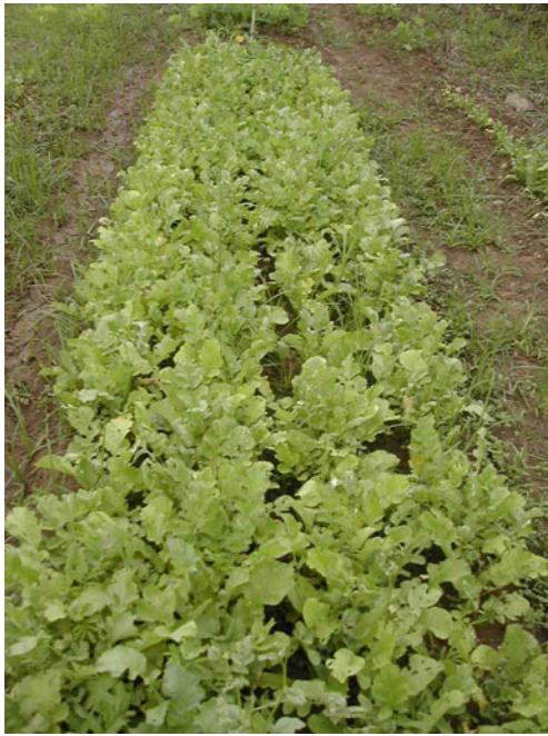
Fig. 13 Fodder radish R. sativus (Martinique)

For instance, some nematicidal plants release toxic compounds that directly affect nematode mobility or hatching and other life processes (Gommers 1981). In the case of A. strigosa reported above, resistance to P. penetrans appears to be associated with increased production of avenacin (LaMondia et al. 2002).