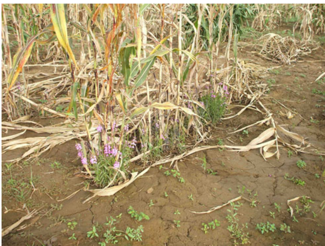
Fig. 11 S. hermonthica on sorghum (Niger)

Other direct effects involve compounds that directly affect pathogen and pest survival (nematicidal, fungicidal or bactericidal compounds) or are feeding deterrents for insect pests with limited movement/dispersal ability (e.g. white grubs).