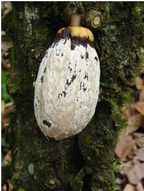
Fig. 4 Sporulating lesions of frosty pod rot of cocoa caused by M. roreri (Costa Rica)

Similar complex relationships are also observed in rust diseases (Uredinales). Wheat stem rust caused by Puccinia graminis is a typical heteroecious rust which switches between common barberry ( Berberis vulgaris ) and cereals. Eradication of barberry in the USA reduced the risk of emergence of new wheat stem rust races through sexual