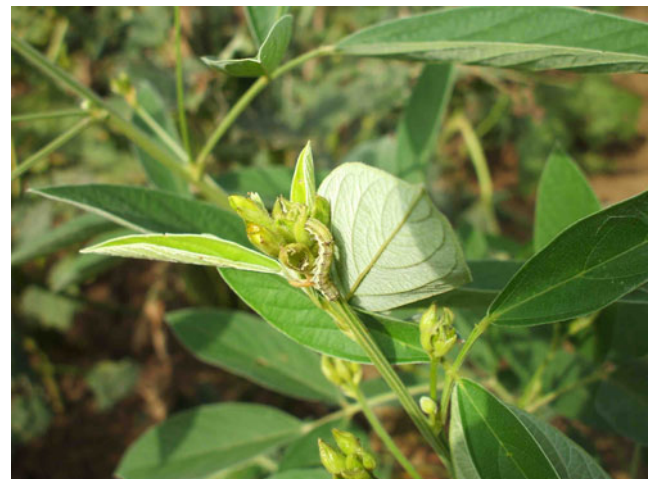
Fig. 8 H. armigera on pigeon pea C. cajan (Niger)

This involves the combined use of trap and repellent plants in an attempt to optimize their individually partial effects. The main example of a successful application of the push–pull principles is that of stem borer management by the International Centre of Insect Physiology and Ecology (ICIPE) and its partners in Eastern Africa (Khan et al.