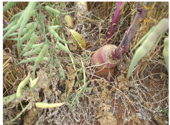
Fig. 12 Fodder radish R. sativus (Madagascar)