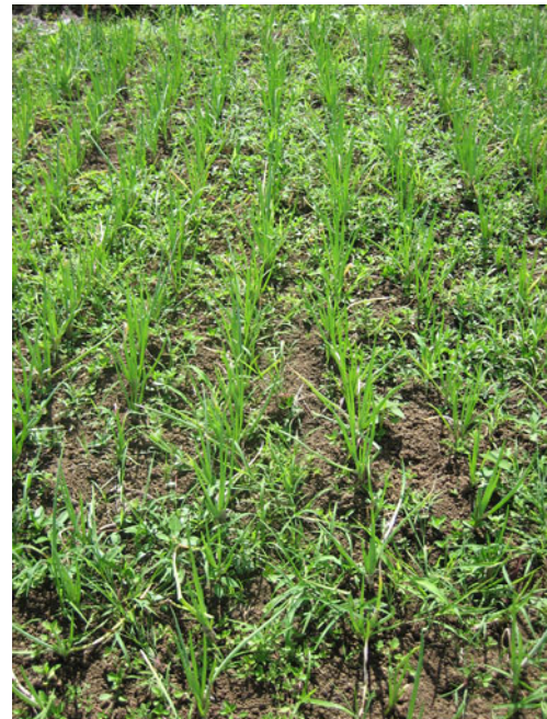
Fig. 2 Chinese chive ( A. fistulosum ) (Martinique)

Some pests sustain themselves on cover crops that thus serve as hosts and favour the build-up of infestation. In Benin, for instance, the cover plant species Canavalia ensiformis and Mucuna pruriens were found to be good alternative host species for the maize pest Mussidia nigrivirens (Schulthess and Setamou 1999). So, in this situation, the use of these particular cover crops was not advantageous.