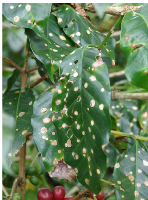
Fig. 16 M. citricolor lesions on coffee leaves

While microclimate can directly affect the pest and its natural enemies, it also has effects via the physiology of the host. Under shade, flower initiation and the yield of coffee trees ( C. arabica ) are lower than under full sun. Yield can actually be very low under excessive shade. On the other