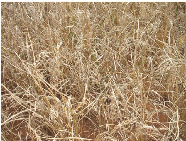
Fig. 14 Rice blast caused by M. grisea (= P. grisea ) (Madagascar)

An indirect positive effect of mulching and of the use of cover crops is thus better crop nutrition from minerals derived from the decomposition of organic matter, provided biofumigants with antibiotic effects on beneficial microorganisms are not released (see “Section 7.4”). Mulching also limits evaporation and contributes to better water nutrition of crops (Scopel et al. 2004), making them better able to withstand attacks by pests or pathogens [e.g. rice to Striga or rice blast (Fig. 14) caused by Magnaporthe grisea (= Pyricularia oryzae )] (Husson et al. 2008; Ou 1985; Sester et al. 2008).