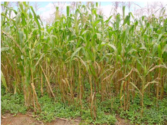
Fig. 9 Maize on a D. uncinatum live cover (Madagascar)

The semiochemicals produced during damage to plants by insect pests, which mediate this behaviour of the pests and parasitoids, have been isolated (Khan et al. 1997a, b, 2003). Six active compounds were identified in trap plants: octanal, nonanal, naphthalene, 4-allylanisole, eugenol and linalool (Khan et al. 2000). In the repellent molasses grass and Desmodium , ocimene and nonatriene, i.e. semiochemicals produced during damage to plants by herbivorous insects (Turlings et al. 1990), were produced together with other sesquiterpenes. It is likely that, as these compounds are associated with a high level of stem borer colonization, they acted both as repellents to ovipositing moths and as foraging cues for parasitoids.