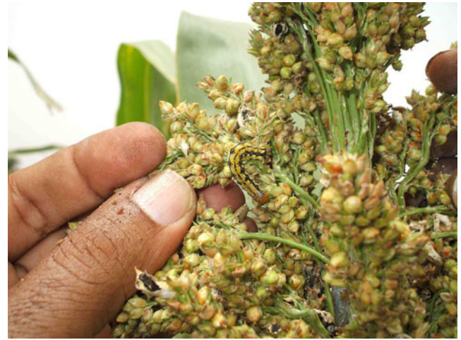
Fig. 7 H. armigera on grain sorghum: S. bicolor (Niger)