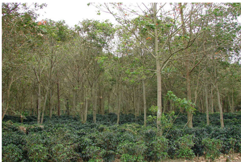
Fig. 15 Coffee-based agroforestry system with a dense shade of eucalyptus and erythrina at free growth in Costa Rica

while Phytophthora pod rot is increased by intermediate levels of shade (Beer et al. 1998), stem canker caused by the same fungus is increased in fields exposed to full sunlight due to water stress.