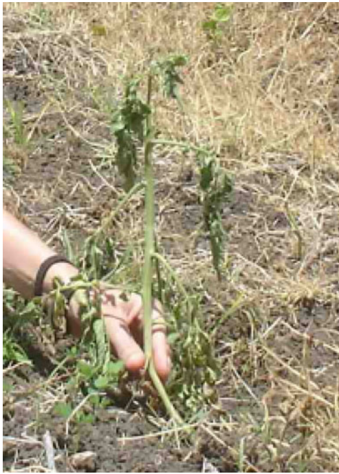
Fig. 3 Tomato bacterial wilt caused by R. solanacearum (Martinique)

Similar complex relationships are also observed in rust diseases (Uredinales). Wheat stem rust caused by Puccinia graminis is a typical heteroecious rust which switches between common barberry ( Berberis vulgaris ) and cereals. Eradication of barberry in the USA reduced the risk of emergence of new wheat stem rust races through sexual