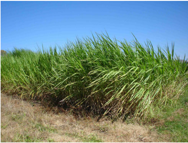
Fig. 5 Napier grass P. purpureum (South Africa)

Conventional trap plants (Hokkanen 1991), which are merely attractants with no “dead-end” properties, may act first as “sinks” for pest populations and become sources of pests for the same field later in the season or for neighbouring fields (Hilje et al. 2001). Care should therefore be taken to avoid the above phenomenon by using other behaviour manipulation methods (Foster and Harris 1997).