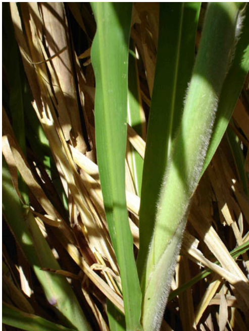
Fig. 6 Trichomes on Napier grass P. purpureum (South Africa)

On the other hand, dead-end trap crops may also end up selecting pest populations that will overcome this suicidal egg-laying behaviour (Thompson 1988; Thompson and Pellmyr 1991).