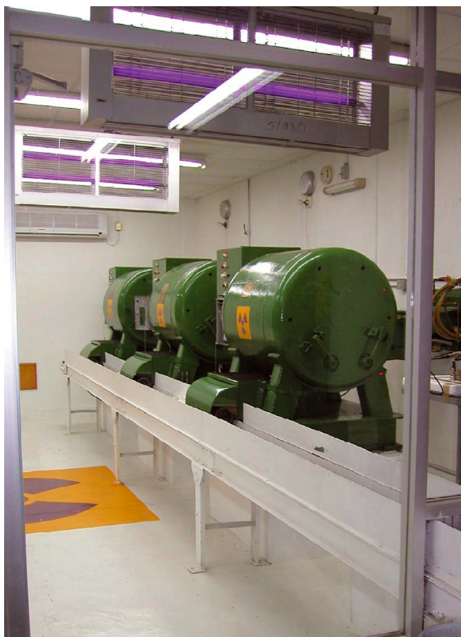
Figure 4. The three ^{137}\text{Ce} Husman gamma irradiators at the New World screwworm mass-rearing facility in Tuxtla Gutiérrez in Chiapas, Mexico.

sterilised and released, all processes that impact the environment in some way, but probably in a similar way to the manufacture of other products for pest control. Large rearing facilities have to be built and they produce many tons of spent diet a day that has to be treated before being used for other purposes, and waste water management is a priority (IAEA, 2008). Biosecurity is an issue where facilities find themselves in eradicated areas through the course of a successful programme, e.g. the New World screwworm mass-rearing facility in Tuxtla Gutiérrez in Chiapas, Mexico (Wyss, 2000). For insect sterilisation, conventional self-shielded irradiators (Fig. 4) are used and the dose received by the irradiated insects is quantified by standard dosimetry (Parker and Mehta, 2007). The transport and importation of this type of gamma cell is governed by international safety procedures and standards and its operation is under strict control by competent national authorities to ensure its safety and security. Releasing insects in large programmes is frequently carried out by aircraft, which again is well regulated and poses no environmental concerns. Many of these same concerns also apply to the mass production of natural enemies, although biosecurity is probably less of a concern, except where pest species are used as hosts.