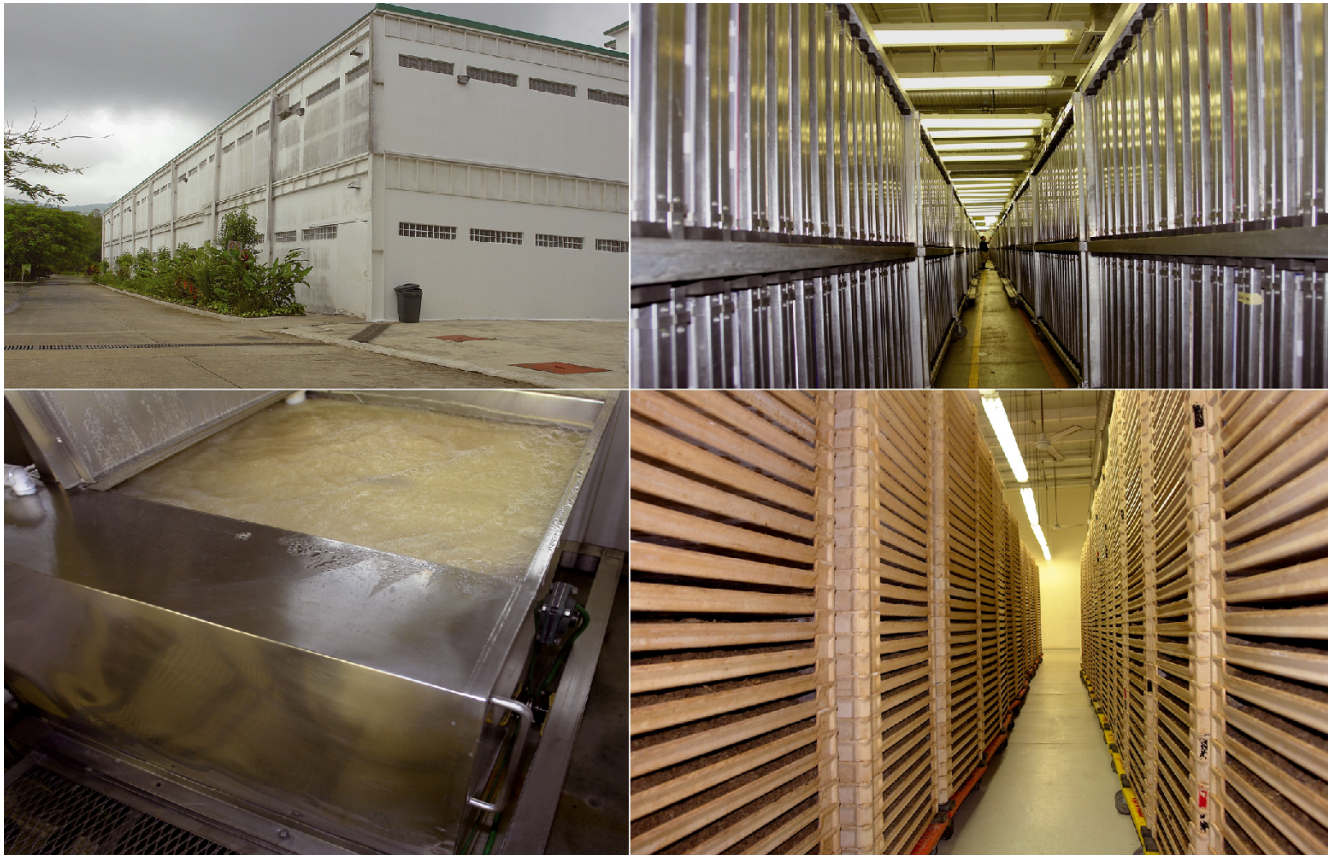
Figure 3. (Upper, left) the Mediterranean fruit fly mass-rearing facility in El Pino, Guatemala, (lower, left) heat treatment of eggs to remove the female sex – each water bath contains 390 million eggs, (upper, right) racks of cages with adult flies, and (lower, right) racks with larval rearing trays.

whereas wild male screwworms mate preferably with wild females) requires a doubling of the amount of sterile insects released per unit surface area to get the same level of suppression as compared with a situation where there is random mating. The release of only sterile males of a species that has a female-choice mating system – such as tropical fruit fly species – is more efficient in population suppression than the release of both sterile males and sterile females. In such species the number of multiple matings per male needs to be minimised because both sperm quality and quantity diminish with successive matings. In addition, sterile males distribute themselves more widely when sterile females are absent (Vreysen et al., 2006a).