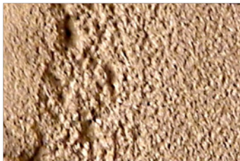
Fig. 2 : An example of cavitation erosion damage

The dynamics of bubble clusters play a prominent role in cavitation and more especially in cavitation erosion. Cavitation clouds are a major source of damage in real cavitating flows e.g.