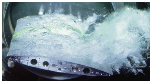
Fig. 1 : Cloud cavitation on a hydrofoil

Bubble clusters are one of the most common forms of cavitation. As an example, for the hydrofoil shown in Fig. 1, a two-phase cavity develops from the leading edge of the foil. This cavity, which is highly unstable, generates cavitation clouds that are shed more or less periodically in the wake. They are made of various types of vapor structures including bubbles and cavitating vortices.