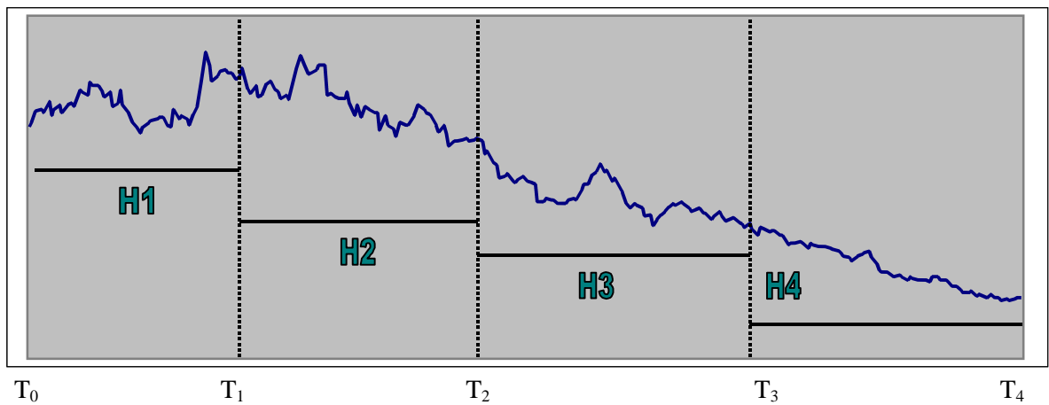
Graph 3 : forward-start early-ending three-step down-and-out option